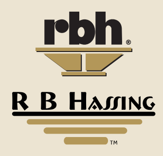
High Performance Home Audio Redefining the Way You Experience Sound™

*Warranted for 5 (five) years from date of purchase to be free from defects and workmanship. For more information see your RBH dealer.