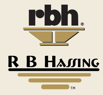
High Performance Home Audio Redefining the Way You Experience Sound™